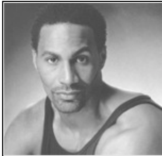
The Art of Technique Summer 2010